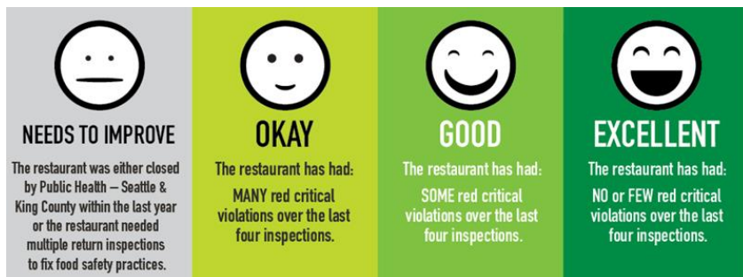
Figure 3 Seattle & King Country's Restaurant Rating System